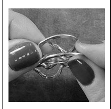
Continue turning band until you have completed a 180degree rotation