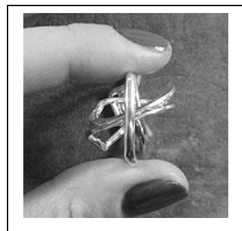
Place Center Band stamped "5" between the thumb and forefinger in your left hand with lip facing away from you.

It all began in the Middle East, a land of mystery and intrigue, with Sheiks, who while riding gaily decorated camels and spirited horses, ruled the desert with golden scepters and gilded swords. This was the birthplace of the famed puzzle rings. Centuries ago these puzzle rings served as wedding bands, and were worn by women of nomadic tribes. The husband held the secrets of the rings. This guaranteed his wife's faithfulness, for the ring once removed from her fingers would fall apart.