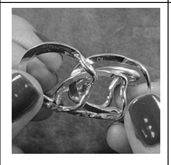
10. Still holding the "3" and "4" bands, take center band, stamped "5" and gently push it down the center of the ring.