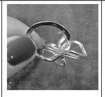
4. Grasp band stamped "4" in your left hand with the stamp facing towards you, allowing the "1" and "2" bands to fall down to one side. This band is the band that crosses over on a diagonal when the ring is assembled.