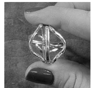
Switch hands and bring band stamped "2" up with your left hand and place next to center band. This is the other outside band.