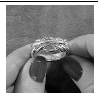
17. Congratulations, you have assembled your ring.