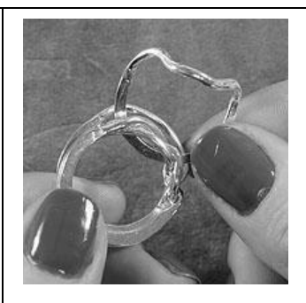
15. Turn ring around and start rotating "1" until the irregular part of the band is on the inside.