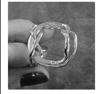
9. When the last step is completed, "3" and "4" create an X.