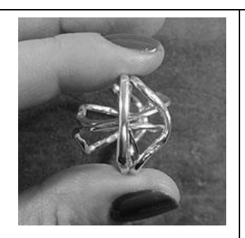
Bring band stamped "1" up with your right hand and place next to center band. The outside portion of the band will be against the center band with the flat stamped side out.