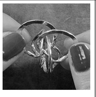
Take the band on the bottom, stamped "3" and bring it up towards you with your right hand until the rings are parallel.