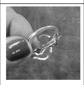
The bands should fit together, holding the two outside bands ("1" and "2")