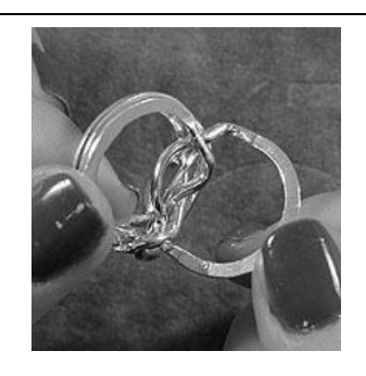
13. When you have completed the rotation, be sure that the "V" shaped part on the inside of the ring is over the remaining loose band