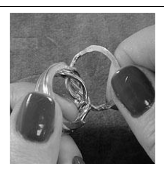
16. When you have completed the rotation, bring "1" band up against the other three rings.