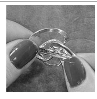
Holding the "3" band between your thumb and forefinger, turn band clockwise.