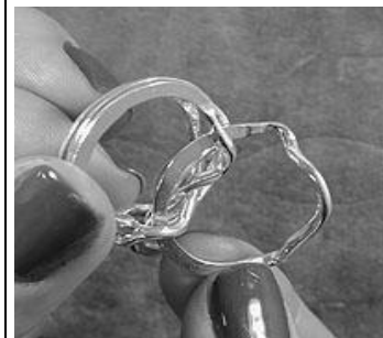
12. Take the first band on the same side which is "2" and rotate the band until the irregular shaped part is on the inside of the ring.