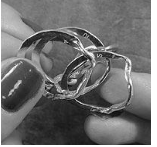
11. The band will slide between "3" and "4". Do not let the ring get too loose; just hold a gentle pressure between your thumb and forefinger.